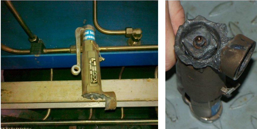
Fig. 1. Safety valve system of oxygen supply after oxygen ignition [PHU 'AQUATICUS', 2011] 8